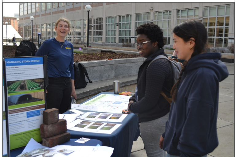
F&O Grounds Services staff talk with students about the benefits of native plantings on campus.