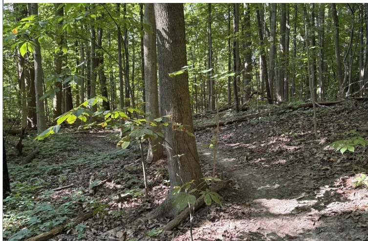
University of Michigan managed forest commonly used for Campus as Lab coursework.

Facilities & Operations Planner's Office - helped identify priority locations for evaluation in support of the Campus Plan 2050.