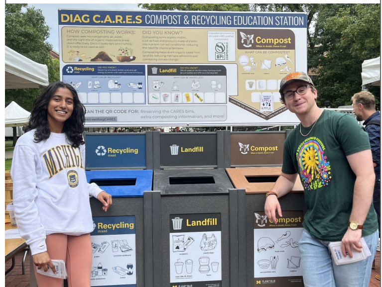
Students who conceived of the Diag-CARES project show off the station at a zero waste event.

Ongoing support to operate Diag-CARES: OCS, MDining, Student Sustainability Coalition, Student Life Sustainability, Planet Blue Student Leaders, Enactus Consulting, LSA Facilities, and others