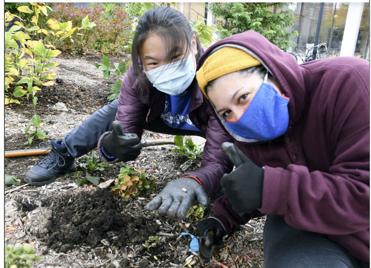
SEAS students install native pollinator garden near the U-M Museum of Natural History.